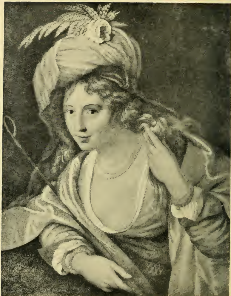
MARIE DE ROHAN, DUCHESSE DE CHEVREUSE